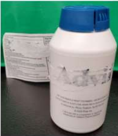
Image: Advil Liqui-Gels, example of torn label (same bottle, different angles)