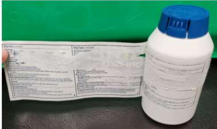
Image: Advil Tablets, example of an intact label