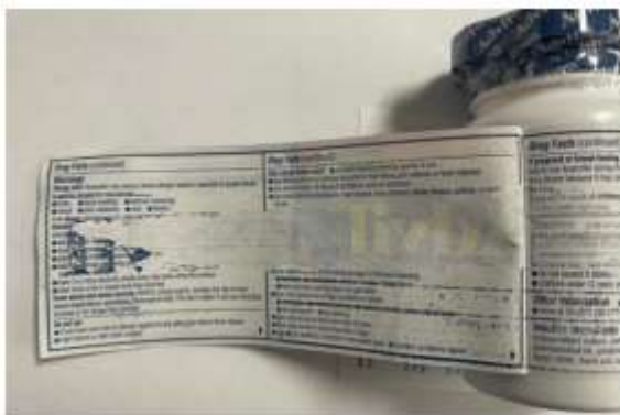
Image: Advil Tablets, example of torn label (same bottle, different angles)